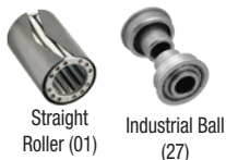
Straight Roller (01)