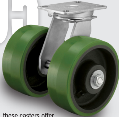
290 Polyurethane/ Iron

In most instances, these casters offer greater capacity, while maintaining the lowest possible overall height. Differential action helps to reduce scrubbing when changing directions. Because they are made from the single wheel caster rig, cantilever-style dual wheel casters can be field built.