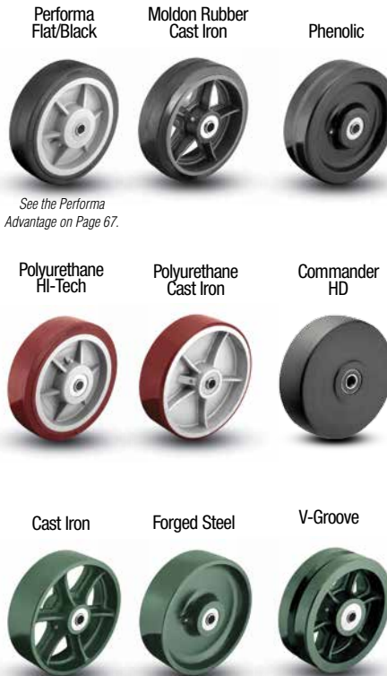
See the Performa Advantage on Page 67.