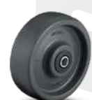
Endura® Solid Elastomer (p. 83)