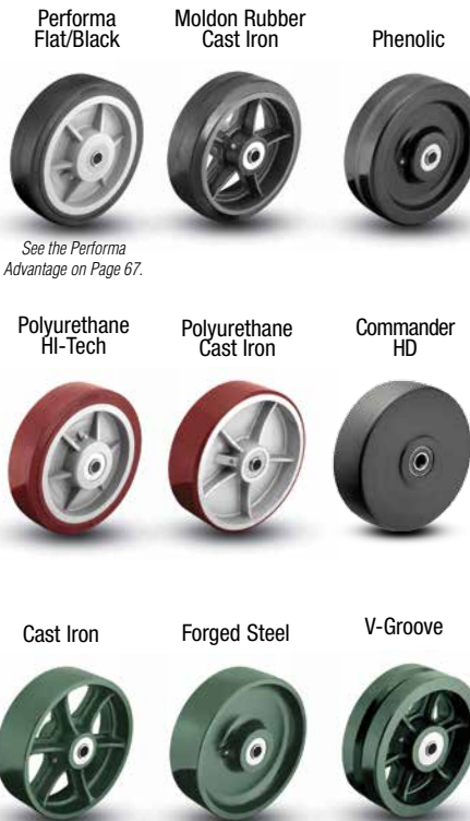
See the Performa Advantage on Page 67.