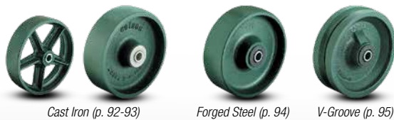
Cast Iron (p. 92-93)

Tread Width: 1-1/4", 1-1/2", 2", 2-1/2", and 3"