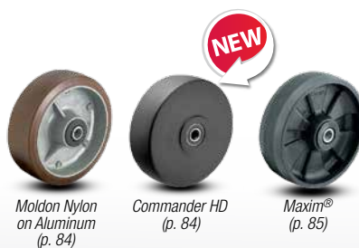
Moldon Nylon on Aluminum (p. 84)