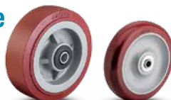
Moldon Polyurethane HI-TECH® (p. 80-81)

For Caster Series: 1, 2, 3, 4, 6, 7, and 8