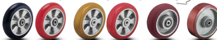
Triumph® Round (p. 78)