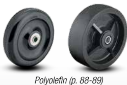
Polyolefin (p. 88-89)

Tread Width: 7/8", 1-1/4", 1-1/2", and 2"