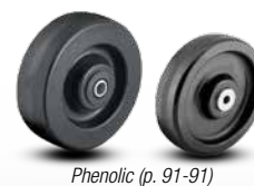
Phenolic (p. 91-91)

Tread Width: 1-7/16", 1-15/32", 1-1/2", 2", 2-1/2", and 3"