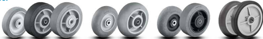
Flat Grey and Black (p. 68-70)