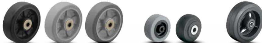
Trans-forma LT (p. 75)