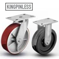
Enforcer p. 58-59

Tread Width: 2-1/2" or 3" Wheel Diameters: 6", 8", 10" and 12" Capacity: 500 lbs to 6,000 lbs each Brakes: Tread lock, swivel lock