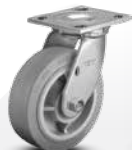
Plate p. 42-45