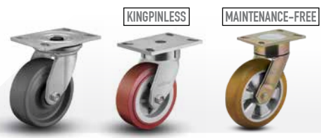
Plate p. 52-53 Enforcer p. 54-55 Evolution p. 56-57

Tread Width: 2" or 2-1/2" Wheel Diameters: 4", 5", 6", 8" and 10" Capacity: 300 lbs to 2,000 lbs each Brakes: Tread lock, side lock, swivel locks