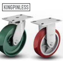
Enforcer p. 60-61

Tread Width: 2-1/2" or 3" Wheel Diameters: 6", 8", 10" and 12" Capacity: 540 lbs to 6,000 lbs each Brakes: Tread lock, swivel lock