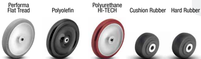
See the Performa Advantage on Page 67.