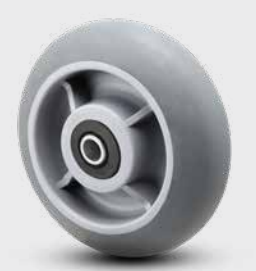
2" Tread Width Ecoforma Round

Pedestal Precision Ball Bearing (PPBB) Option (2" tread width): Change the 10th digit to "5" (Example: E5.00006.575). 2-Piece Delrin Bearing With Bushing Option (2" tread width): Change the 10th digit to "1" (Example: E5.00006.571). Less Bearing Option (2" tread width): Change the 10th digit to "6" (Example: E5.00006.576).