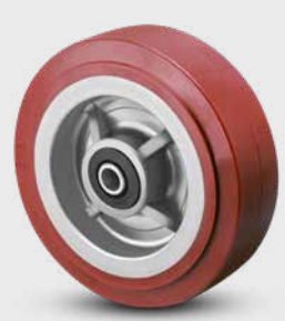
2" Tread Width Ecopoly