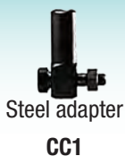
Steel adapter CC1

Comes with red and green (off/on) pedal caps