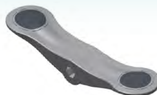
Foot Pedal Double (Plastic)