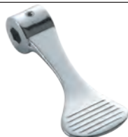
Foot Pedal Single