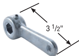
Transmission Lever Long