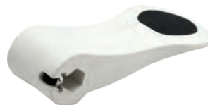
Foot Pedal Single (Plastic)