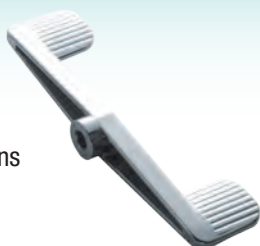
Foot Pedal Double

Rhombus Caster pedals combine ergonomics and durability in an easy-to-operate design that functions flawlessly with Rhombus Caster braking systems.