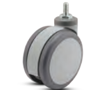
Antistatic available, see page 102-103.

Special colors available. Consult factory.