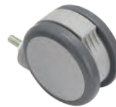
Undercover shield for ultimate protection.

Special colors available. Consult factory.