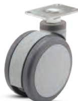
Antistatic available, see page 102-103.

Special colors available. Consult factory.