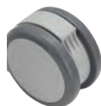
Undercover shield for ultimate protection.

Special colors available. Consult factory.