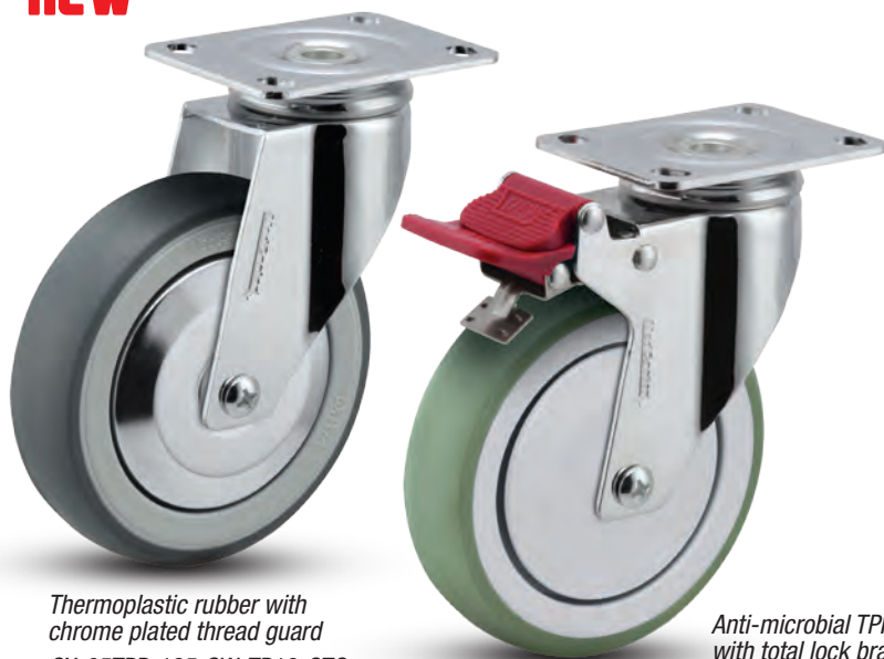
Thermoplastic rubber with chrome plated thread guard CX-05TPP-125-SW-TP13-CTG