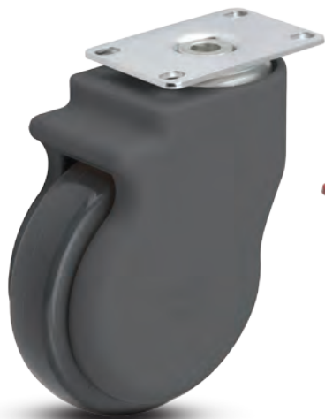
Free swivel model CP-05PYP-125-SW-TP13G

FREE SWIVEL • TOTAL LOCK • DIRECTION LOCK