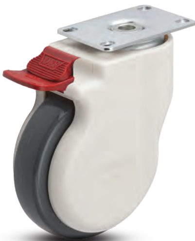
Total lock model CP-05PYP-125-TL-TP13W