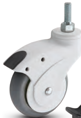
OP Page 17