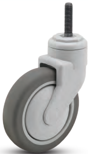
PG Page 92-27