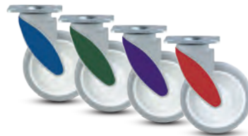
Custom colors available. Consult factory for minimums.