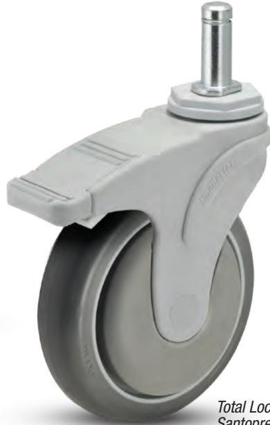
Total Lock with Santoprene wheel