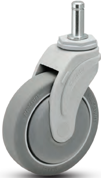
Free swivel with QuickStart TPR wheel:

FREE SWIVEL • TOTAL LOCK • DIRECTION LOCK