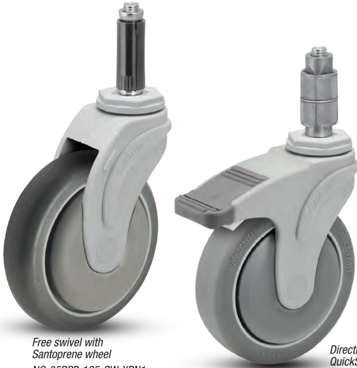
Free swivel with Santoprene wheel NG-05RPP-125-SW-XRN1

EXPANDING ADAPTER STEM MODELS FREE SWIVEL • TOTAL LOCK • DIRECTION LOCK