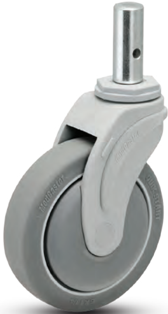
Free swivel with QuikStart wheel NG-05QDP-125-SW-RS01

ROUND/SQUARE STEM MODELS FREE SWIVEL • TOTAL LOCK • DIRECTION LOCK