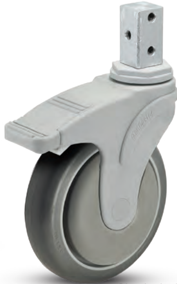
Direction Lock with Santoprene wheel NG-05RPP-125-TL-SQ02