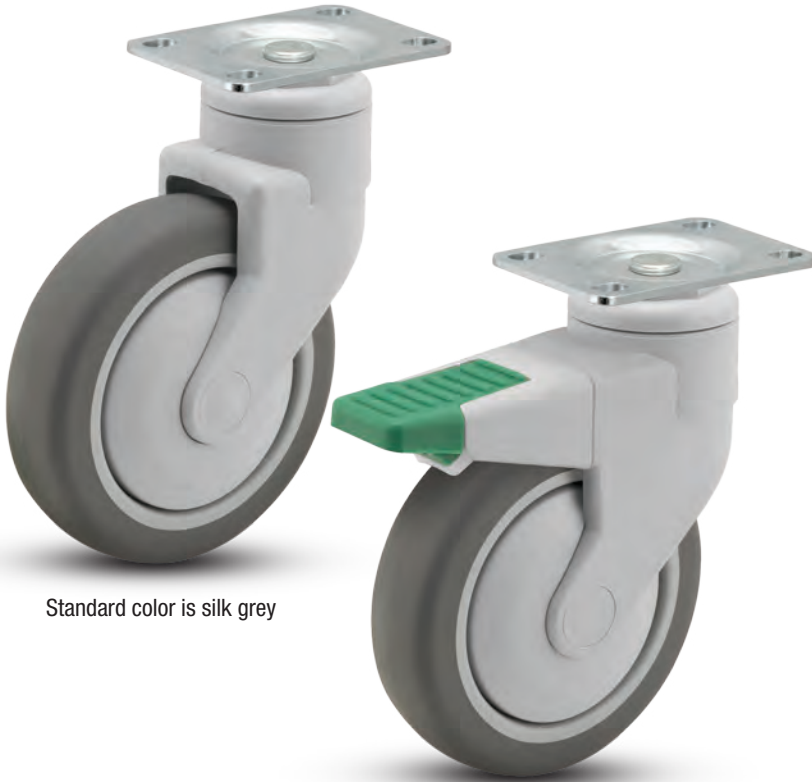
Standard color is silk grey

FREE SWIVEL • TOTAL LOCK • DIRECTION LOCK