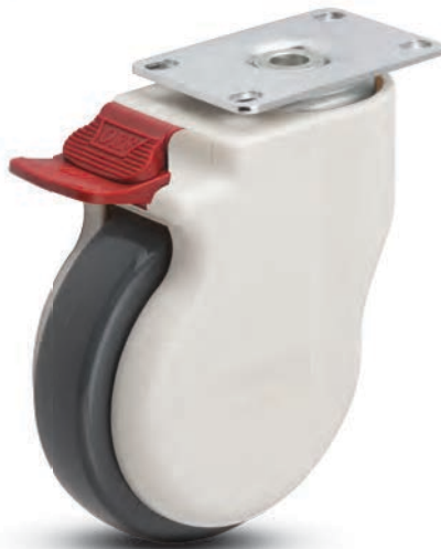
Total lock model CP-05PYP-125-TL-TP13W