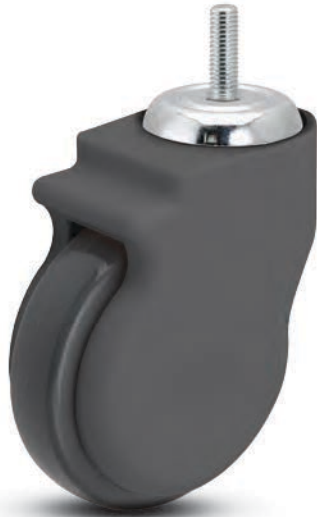
Free swivel model CP-05PYP-125-SW-TS02G

HOLLOW KINGPIN MODELS FREE SWIVEL • TOTAL LOCK • DIRECTION LOCK