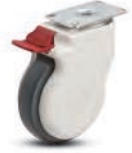
Total Lock Red pedal.