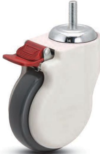
Total lock model CP-05PYP-125-TL-TS02W