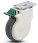
Direction Lock Green pedal.