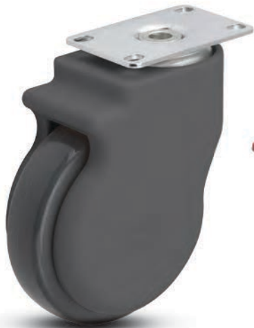
Free swivel model CP-05PYP-125-SW-TP13G

FREE SWIVEL • TOTAL LOCK • DIRECTION LOCK