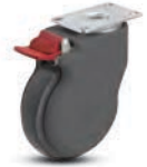
Total Lock Red pedal.