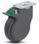
Direction Lock Green pedal.