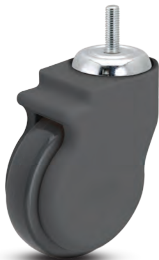
Free swivel model CP-05PYP-125-SW-TS02G

FREE SWIVEL • TOTAL LOCK • DIRECTION LOCK