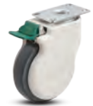
Direction Lock Green pedal.