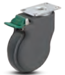
Direction Lock Green pedal.