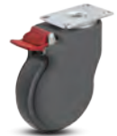
Total Lock Red pedal.