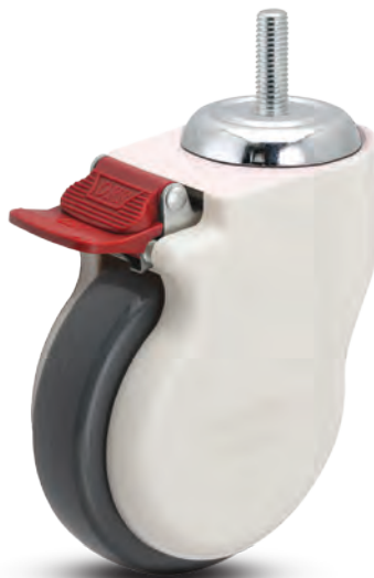
Total lock model CP-05PYP-125-TL-TS02W