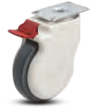
Total Lock Red pedal.