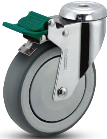
Thermoplastic rubber wheel with direction lock SX-05TPX-125-DL-HK01