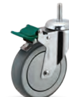
Direction Lock Green pedal.

Stems ship with a loose bolt for easier alignment of the directional lock.