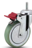
Total Lock Red pedal.