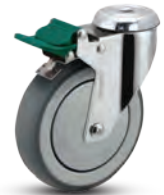
Direction Lock Green pedal.