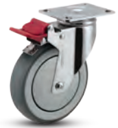
Total Lock Red pedal.