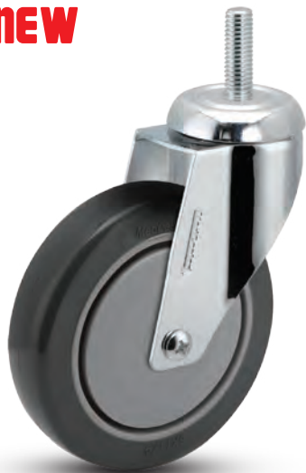
Polyurethane TPU wheel SX-05PYX-125-SW-TS02