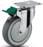
Direction Lock Green pedal.