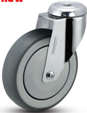
Thermoplastic rubber wheel SX-05TPX-125-SW-HK01