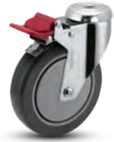
Total Lock Red pedal.