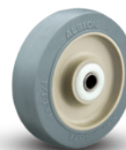
XS Prevenz™ X-tra-soft Rubber Flat Tread