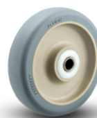
XA Prevenz™ Polyurethane on Polypropylene

The EPA registered and FDA compliant antimicrobial additive used in Prevenz™ wheels is designed to suppress the growth of a variety of destructive and odor causing microbes including bacteria, molds, mildew and fungi. These wheels are suitable for a variety of applications including medical equipment, food equipment, pharmaceutical, chemical, meat & poultry, processing plants and more. To order add "PREV" to end of caster number.