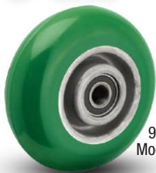
95 Shore A Models